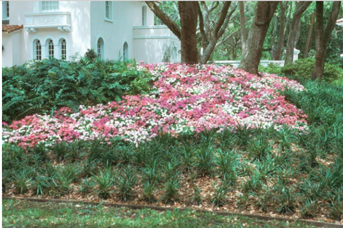
Figure 6. Plant annuals and perennials on raised beds to ensure good drainage and improved visibility.

To achieve the best color displays, annuals and herbaceous perennials must have good drainage, adequate nutrients and available water at all times. Begin by deep tilling the native soil to improve its structure and to ensure good drainage. Then, elevate the bed 6 to 12 inches by adding soil amendments. A raised bed not only ensures good drainage, but also improves the visibility of the color display.