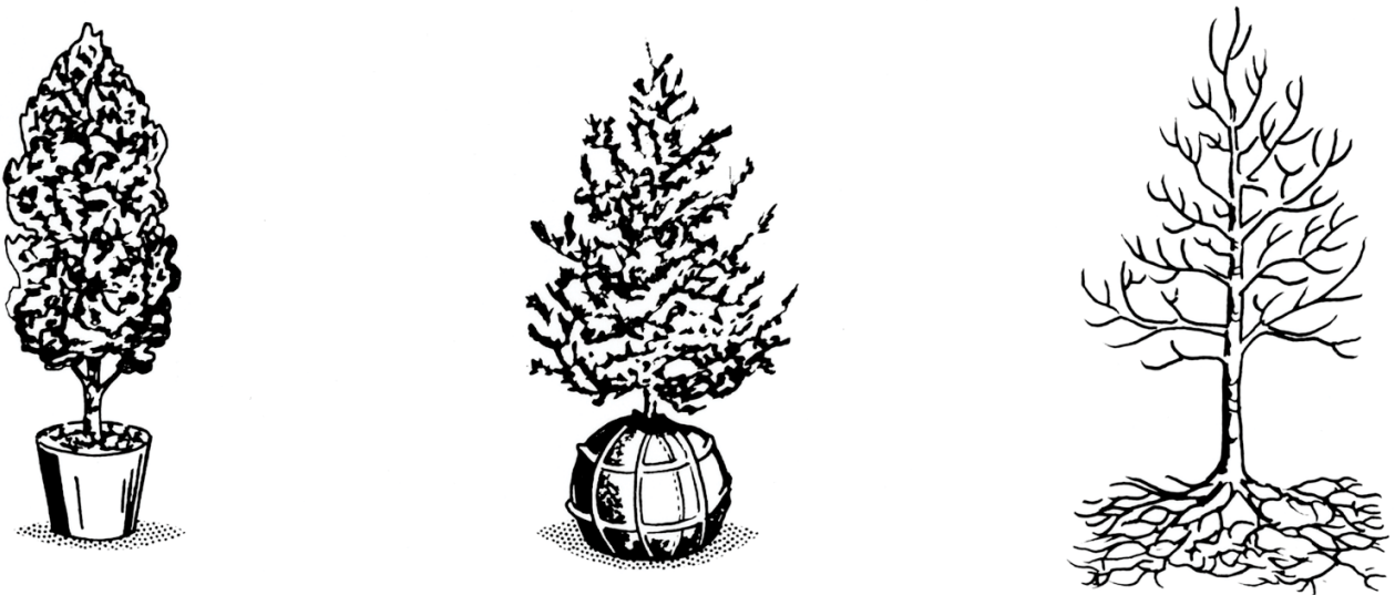
Figure 2. Woody ornamentals for the landscape are commonly sold three ways: container-grown (left), balled-and-burlapped (center) and bare-rooted (right).

Large trees and shrubs grown in the field are often sold balled-and-burlapped. Because a large portion of the root system is destroyed during digging, they transplant best during the cooler months (October through April). Some trees are grown and marketed in fabric bags, and can be transplanted throughout the year, although the fall and winter months are best.