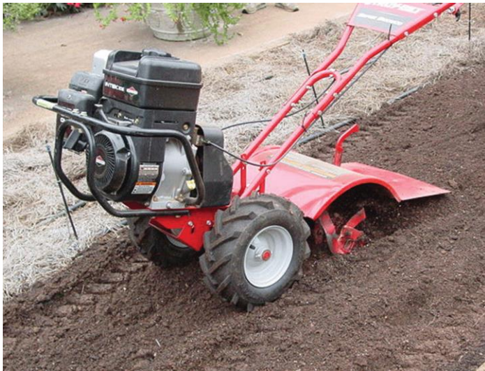
Figure 5. When planting a group of ornamental plants in the landscape, prepare a good bed by deep tilling to a depth of 12 to 15 inches.

A group of ornamental plants in one area of the landscape will grow more uniformly when planted in a well-prepared bed rather than in individual holes. Begin by deep tilling to a depth of 12 to 15 inches. Then incorporate about 1 pound (2 cups) of an eight to 10 percent nitrogen fertilizer, such as 8-8-8 or 10-10-10, over every 100 square feet of bed area. Only incorporate lime into the bed if the soil test recommends it. After preparing the soil, follow the planting procedure recommended for planting in individual holes.