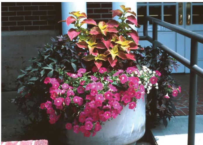
Figure 7. Containers let you put splashes of color where you want it, regardless of soil type, and offer an alternative to flowerbeds. For best results, use quality potting soil and a well-drained container.

The type and quantity of soil amendments used depends on the structure and texture of the existing soil, and whether amendments have been previously added to the site. A combination of composted organic matter, composted animal manure and large-particle sand, such as Lithonia granite, are frequently used to amend beds. If bagged organic amendments are used, apply one 40-pound bag per 100 square feet of bed area and incorporate it to a 6- to 8-inch depth. An ideal soil is moist, yet well drained.