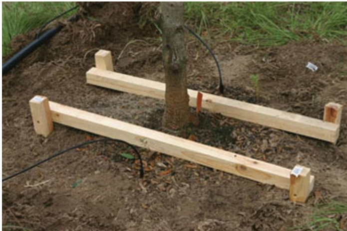
Figure 9. A root ball staking system is an alternative to guy wires.

Give the tree some slack so it can move slightly with the breeze. Research indicates that a tree allowed some movement during establishment develops a larger root system and stronger trunk than one that is kept stationary.