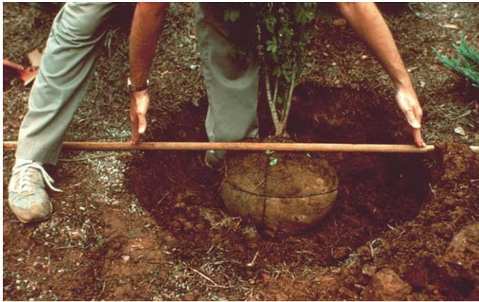
Figure 3. Dig the planting hole two times wider than the root ball. Make certain the top of the root ball is level with the soil surface.

the hole is dug deeper, backfill it with soil as necessary and tamp it firmly to prevent settling. Make certain the top of the root ball is level with the soil surface. Some landscape professionals plant the top of the root ball 1 to 2 inches above grade if they know the soil is likely to settle slightly.